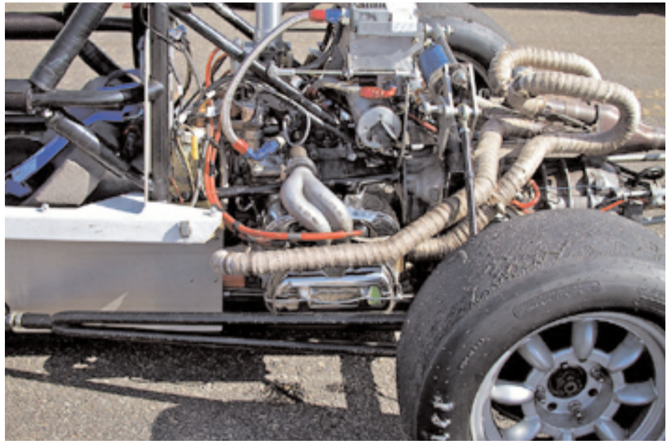
Formula First is a lot of racecar for the money. It's the perfect entry level car for someone interested in open wheel racing.

In 2002, a "test" car was built to the basic Australian rules to check out each upgrade area as well as build support for the concept. Formula First test car programs have been successfully used in many places around the world. Remember that resistance to change has been the key to FV success, so it has been impera-