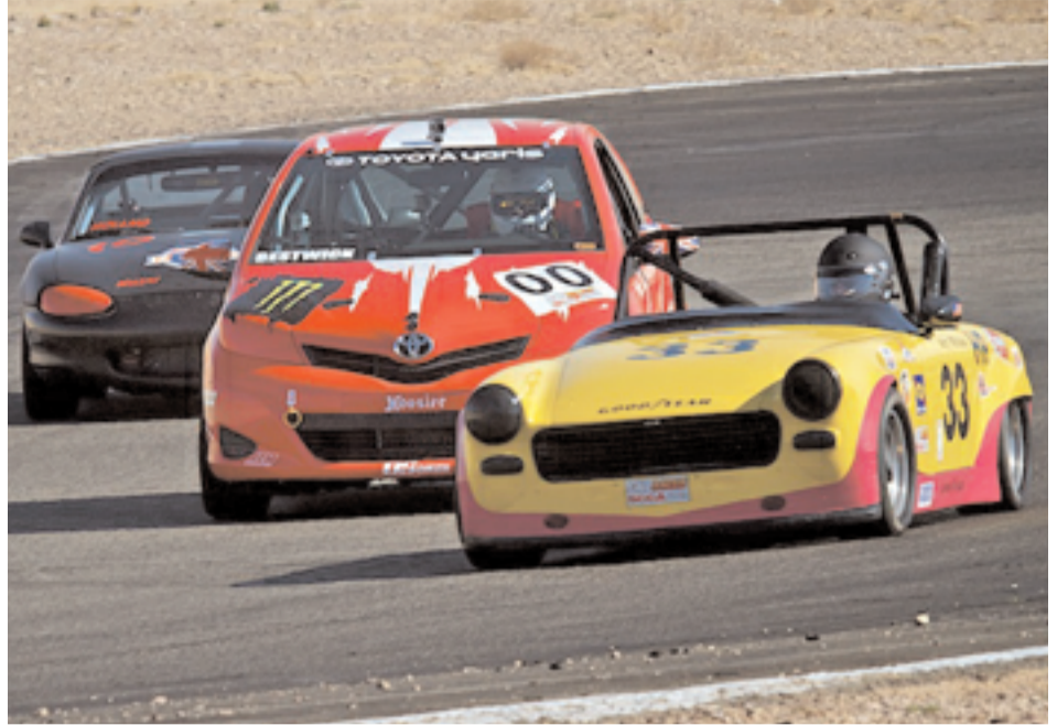
Gary Wittman (#33) was able to fight off all challengers in H Prod to earn two first place finishes.

Sunday was redemption day for Husting and he made a statement by setting fast time