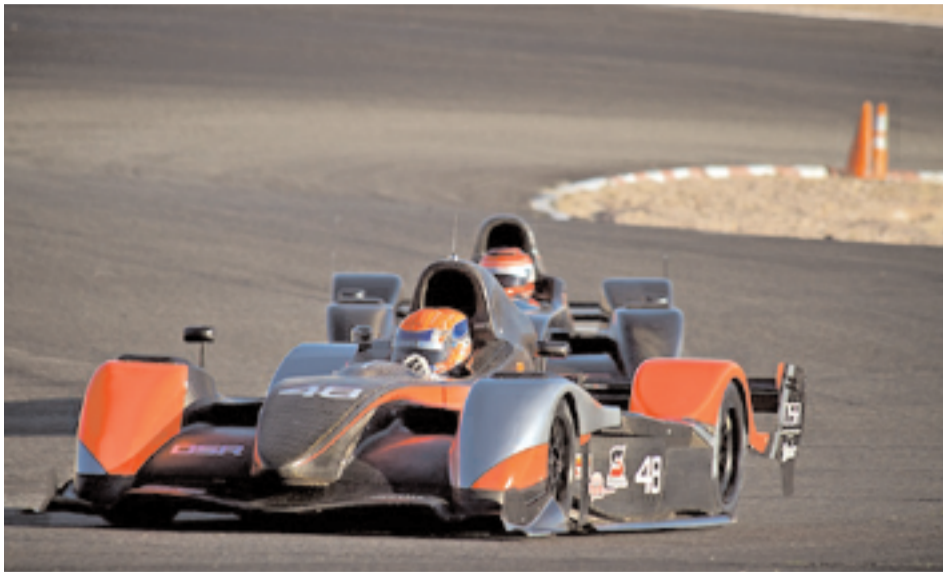
When Lee Alexander is on track it's a requirement to drop everything and watch. This weekend he dominated the overall race pace before tallying two wins in DSR.

then parked it moving Nicklin to the runner up position when the checkered flew. Tweedie was credited with third.