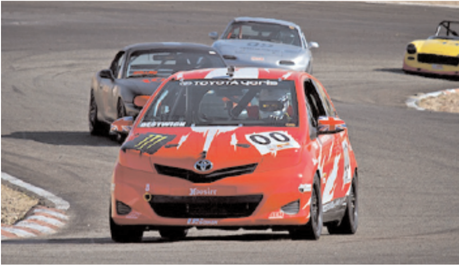
BMX champion Jamie Bestwick continues to get seat time on four wheels in his B-Spec Toyota Yaris trimmed out for H Prod.