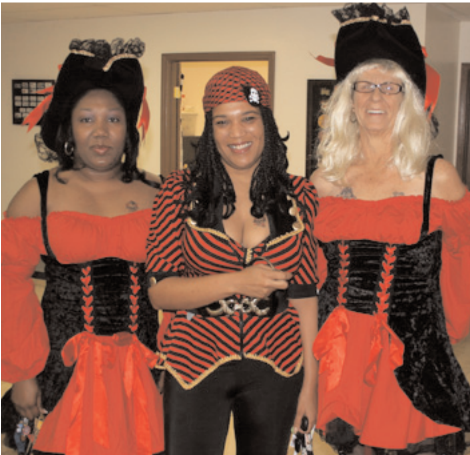
Grid Girls in costume at a Pumpkin Run race weekend.