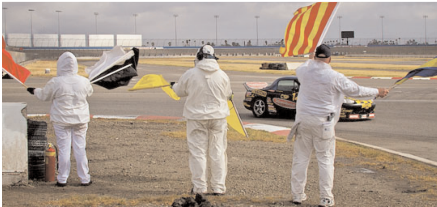
Flaggers active on every corner waving flags as a parade of Solo vehicles participated in Renee Angel's Memorial Lap at Auto Club Speedway during Saturday's lunch break.