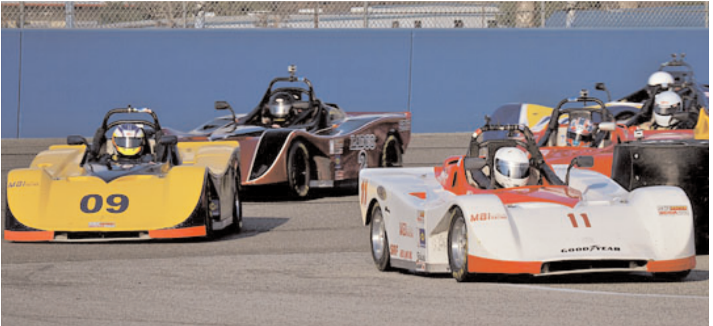
Mike Miserendino (#11) grabs the hole shot on Kyle Eggleton (#09) and others.

second. Discussion followed that Harris might have a transponder mounting issue that needed to be looked into, at least to confirm whether it's in the correct location or not.