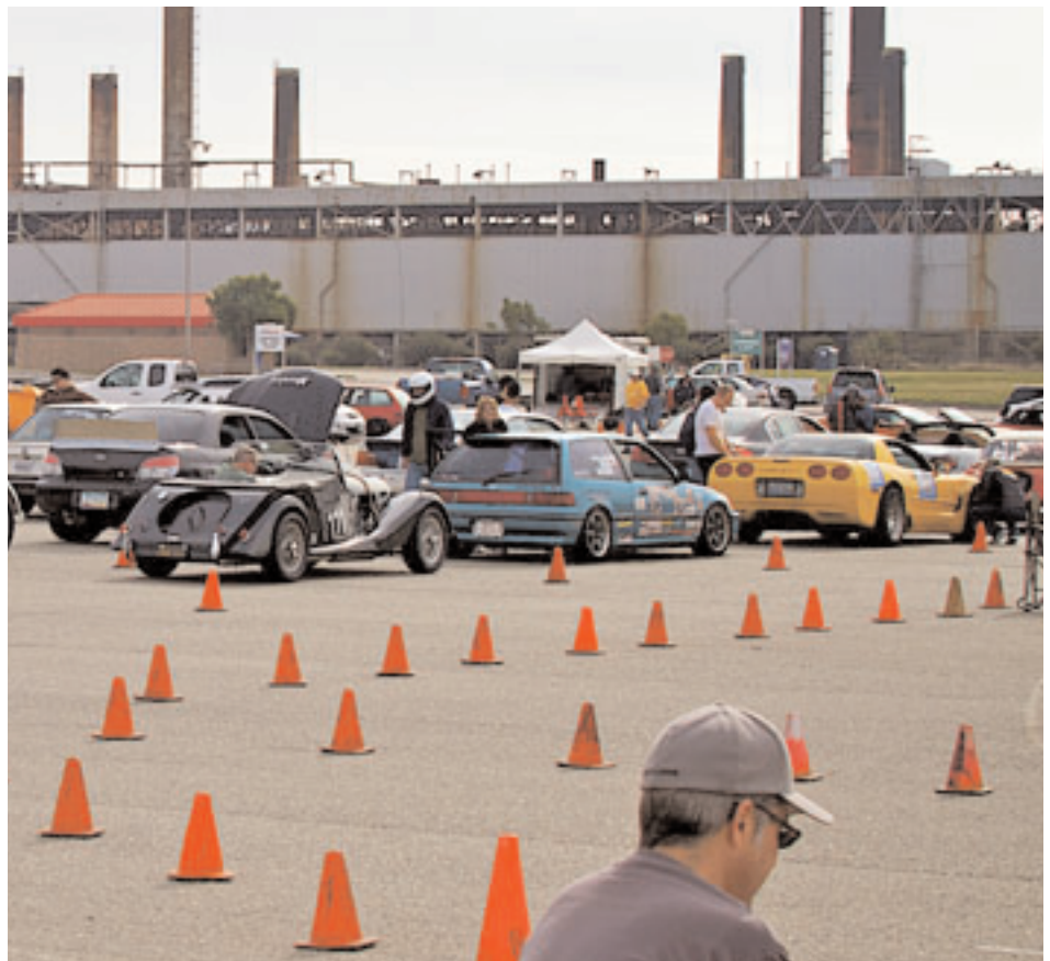
Solo enthusiasts staging for their next session.

Sunday was a beautiful day with delightful weather and most important, rain free.