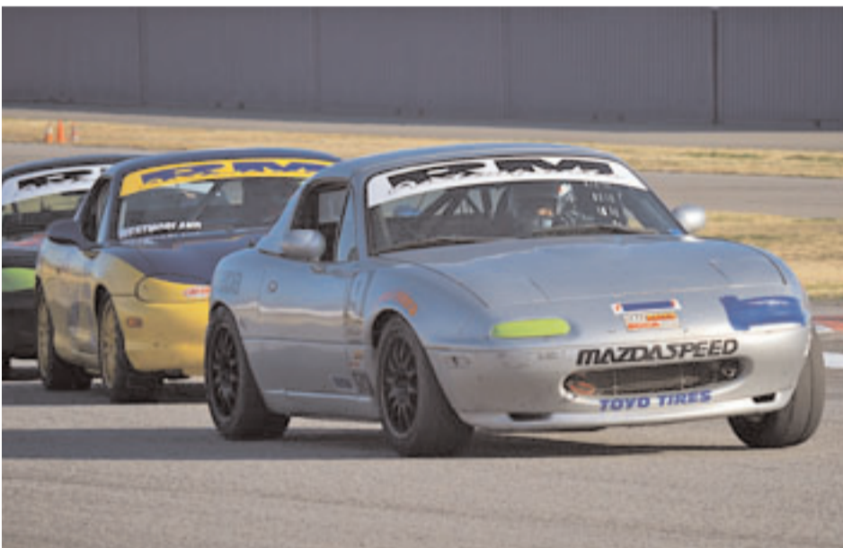
Don Thibaut captured the Spec Miata National win. Baer Images Photo