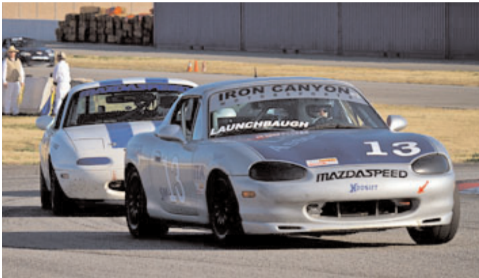
Todd Launchbaugh (#13) collected the win in ITA Saturday.