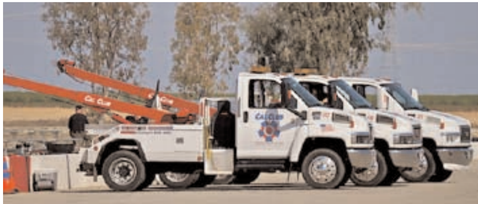
Who has the tightest Emergency equipment in auto racing? You got it, Cal Club!