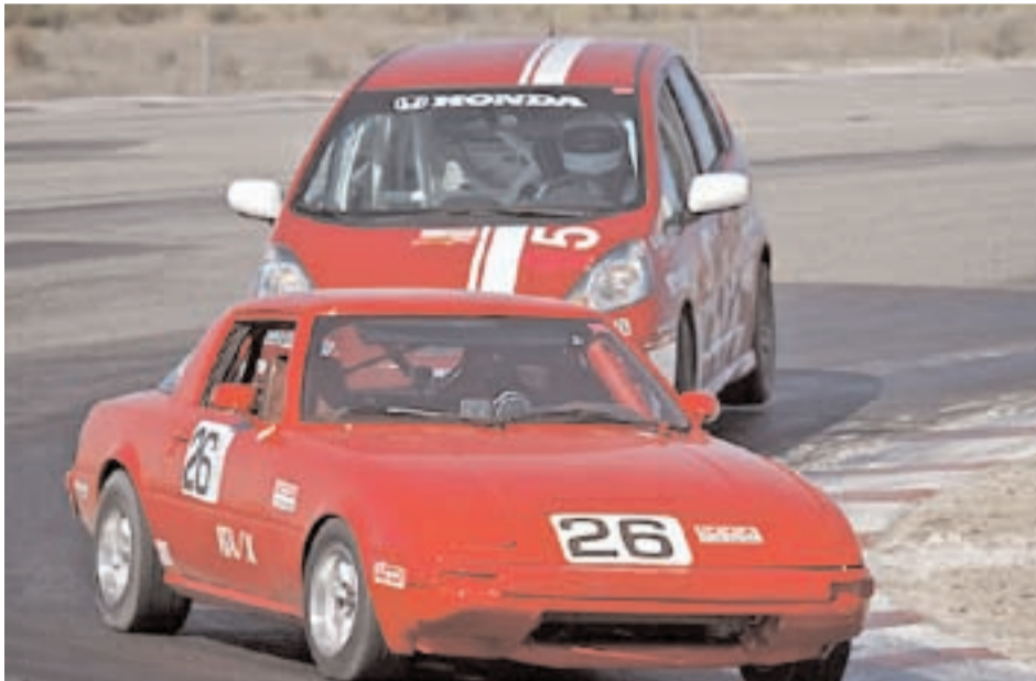
Nick Corsiglia (#26) fights off Roy Richards for position in Saturday's Super School closed wheel race.