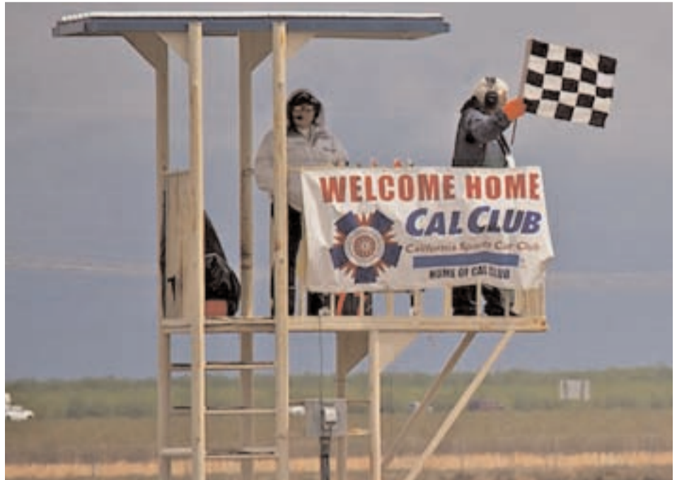
Welcome home Cal Club was the message this weekend as we returned to BRP for the first Double Regional and only Super School of 2012.

Sunday's regional was on the big course, configuration 1CW, with Super School graduates joining in for their first