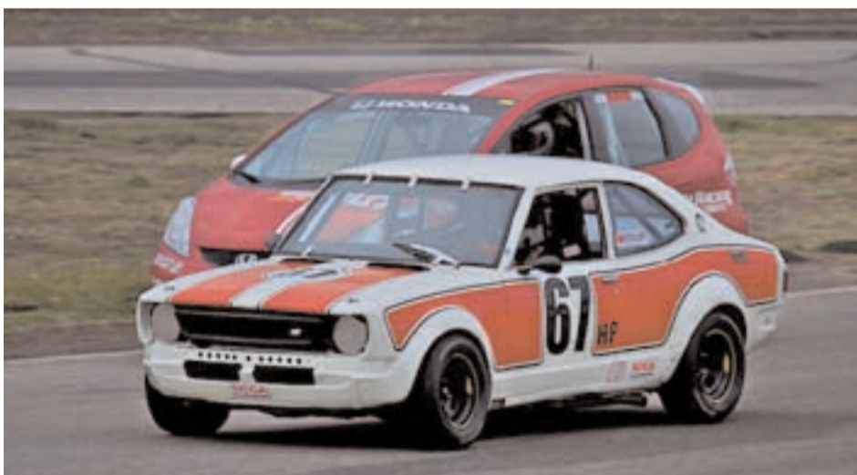
Super School graduates Richard Garver (#67) and Roy Richards battle in their first Cal Club race.

biggest surprise of the day was the request by combined Group 1&3 to limit their race to eight laps. There were several others who refused the challenge of a wet track due to no rain tires or the incorrect set up and went home. With one group down to a single car it was somewhat expected some kind of a merger would occur.