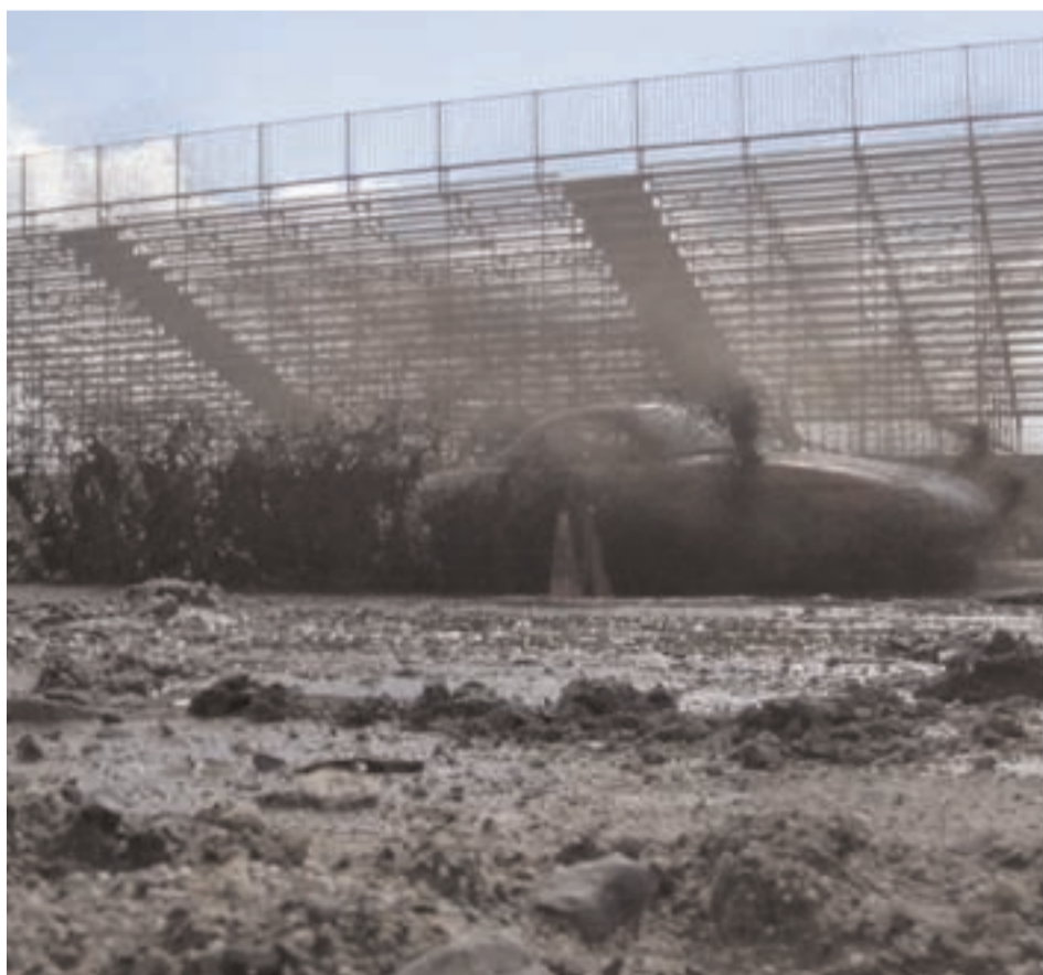
Saturday's overnight rain may have dampened the course, but not anyone's spirit.

Final run group of the day consisted of fifteen Mod 4wd entries. With the smiling god of rally, no DNFs were recorded. At the top of the heap with a