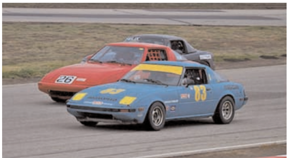
Carl Johnk (#83) running wheel to wheel with rookie Nick Corsiglia.

SGT2 - After qualifying yesterday but not making the show due to complications Ramon