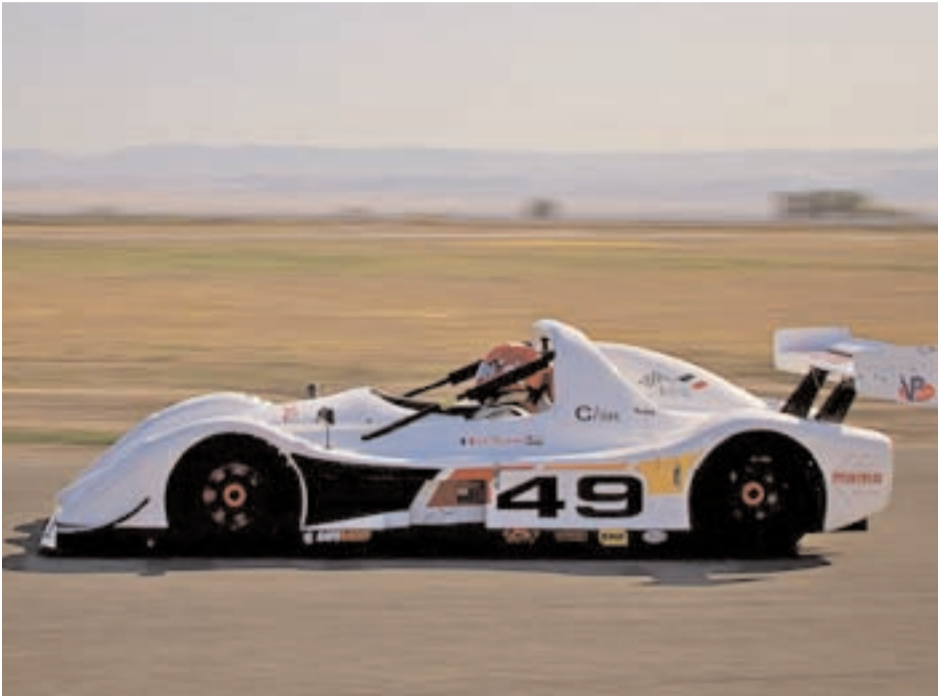
CSR winner Bob Majorino captured the Group 3 overall win on Saturday.