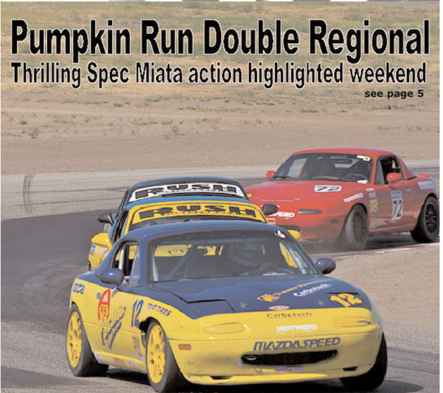
Grant Westmorland #12 Spec Miata